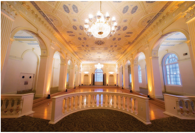
view of the Imperial Ballroom