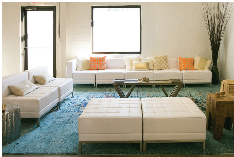
lounge seating area